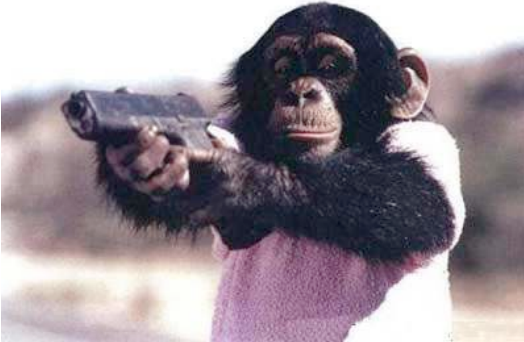
Sympathetic Response, maybe?

gives you energy. That's where we provide our energy and the term yang is associated with this branch of the nervous system. Yang is hot, is hard, it male, is dry. These are all descriptions of the reactions within our bodies and the reactions within nature that this sympathetic nervous system stimulates.